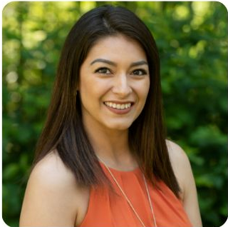
Atenas Mena Clean Air Now