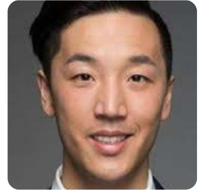
Rep. Rui Xu 25th District