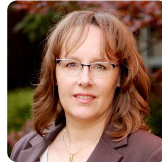
Tami Alexander Metropolitan Energy Center