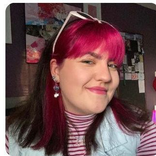
Birdie Alt Loud Light